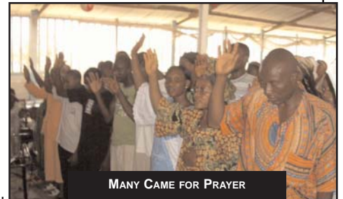
MANY CAME FOR PRAYER