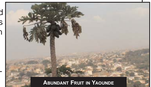
ABUNDANT FRUIT IN YAOUNDE