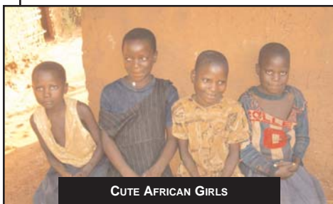
CUTE AFRICAN GIRLS