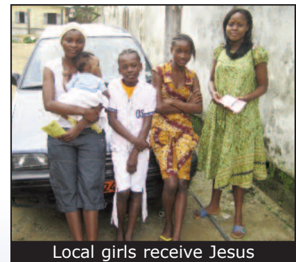
Local girls receive Jesus

to the streets in teams of two without trainers. Upon their return he matched them up with trainers and sent them out again. The harvest was great with 127 people professing Jesus as Lord. The celebrating lasted for an hour.