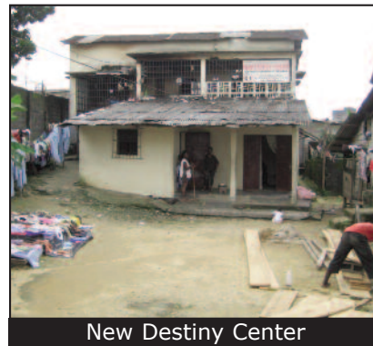
New Destiny Center