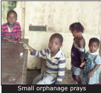
Small orphanage prays