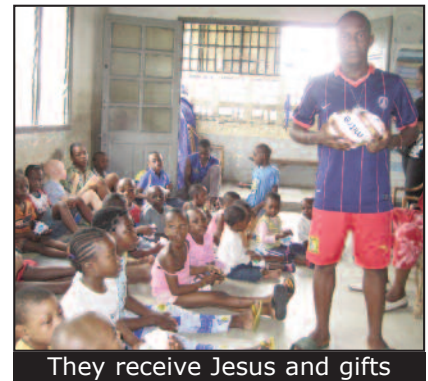
They receive Jesus and gifts