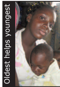
Oldest helps youngest