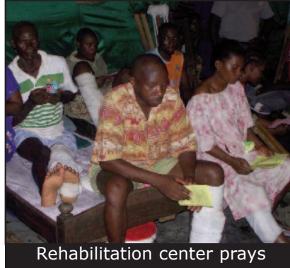
Rehabilitation center prays